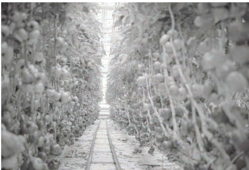
▲ Montreal's Lufa Farms grows red cocktail tomatoes and lots of other crops on vertical walls