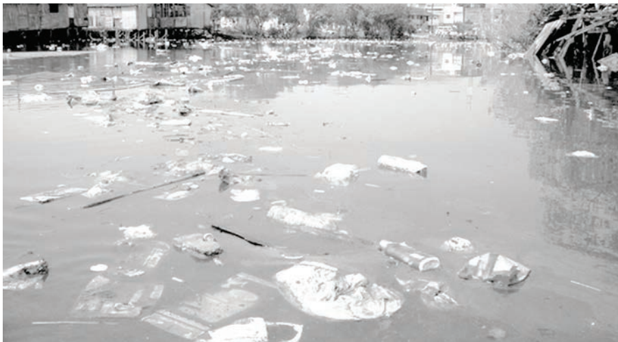
▲ Increasing domestic waste partly due to agricultural, rural and craft village activities

Over the past years, production activities in craft villages have developed rapidly but mainly spontaneously at a small scale with basic and outdated technology and limited space.