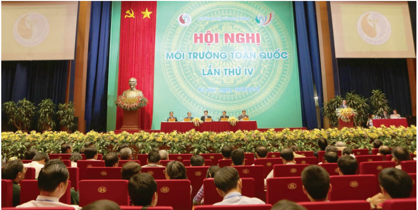
▲ Plenary session of the 4 th National Environment Conference

The 4 th National Environment Conference was organized by the Ministry of Natural Resources and Environment (MONRE). On September 29 - 30, 2015, at the National Convention Centre. The Conference was attended by more than 2,000 participants, leadership representatives of Party's committees, National Assembly's agencies, Government Office, Ministries, sectors, central socio-political organisations; leadership representatives of Provincial Party's Committees, Provincial People's Committees, Department of Natural Resources and Environment, Environmental Protection Sub-department, Industrial zone management board of 63 provinces; representatives of universities, institutes, research centres and experts in the environment field; some domestic and foreign enterprises, international organisations in Việt Nam; national and local mass media... Particularly, the Conference had the honour to welcome to participation and welcome speech by Prime Minister Nguyễn Tấn Dũng.