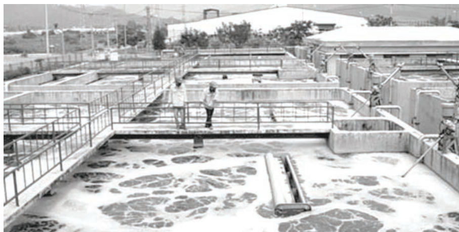
▲ Wastewater treatment plant of Hoa Khanh Industrial zone (Đà Nẵng)