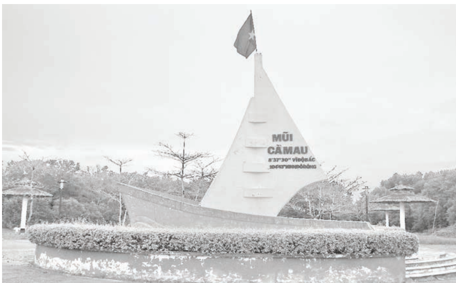
▲ Cà Mau Cape symbol

In addition, Cà Mau is an attractive destination for tourists to visit the national marker coordinate (Road marker number 0, the endpoint of the country), which is a very special location for Vietnamese. This has the symbol of Cà Mau Cape; tourists can see the Cà Mau Cape from the forest view pavilion, visit the revolutionary forest village model, etc.