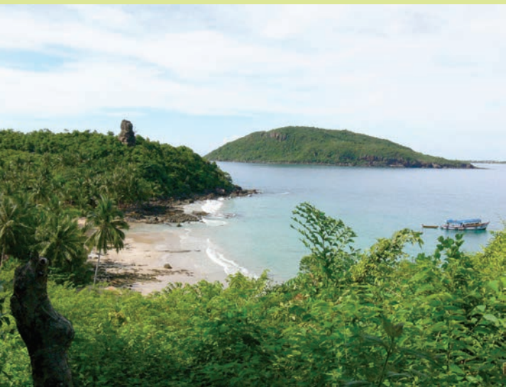
▲ Phú Quốc island

Phú Quốc island (Kiên Giang province) has been named as one of the top 10 most beautiful Asian islands. It is the largest island in Việt Nam,