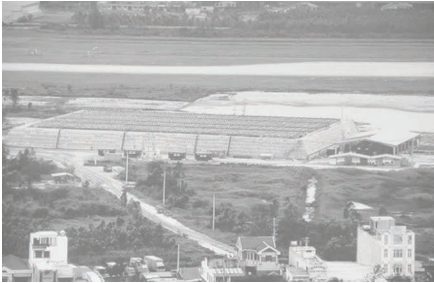
▲ Figure 3. Since 2012, USAID and Ministry of Defense of Việt Nam have used thermal adsorption for dioxin decontamination in Đà Nẵng Airport

Wastewater from the above mentioned solid waste treatment facilities was also tested for dioxin. Results showed that TEQ of the tested wastewater ranged from 0.84–50,080pg WHO-TEQ/L. Dioxins with high concentrations in the tested samples mainly were 1,2,3,4,5,6,7,8-HpCDD and OCDD while 2,3,7,8-TCDD was found at a small level. Compared with Japanese permitted levels of dioxin and related compounds of 10pg TEQ/L, up to nine of 15 samples were found to exceed the levels. Some samples even had up to 50,075pg TEQ/L.