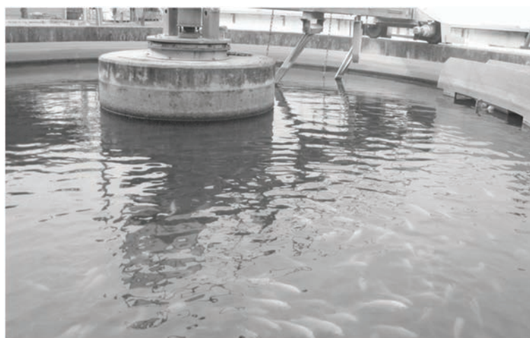
▲ Pilot fishing pond with treated wastewater