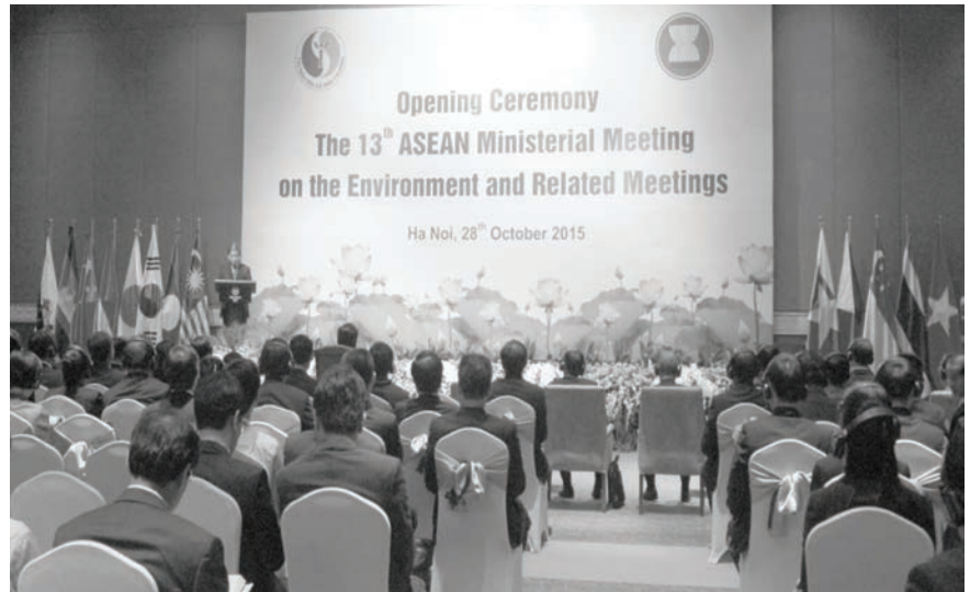
▲ Minister of Natural Resources and Environment, Nguyễn Minh Quang delivered a speech at the Opening Ceremony of the 13 th Ministerial Meeting on the Environment and relevant meetings

In the past few years, climate change response and environmental issues of ASEAN countries have been enhanced and achieved remarkable outcomes: the overall environment of ASEAN is maintained and ensured for healthcare and ecosystem; some ASEAN states achieve high rankings on Environment Productivity Index (EPI); ASEAN completed the implementation of cooperation actions on sustainable environment in the Overall Plan of the ASEAN