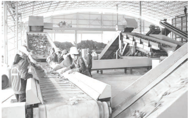
▲ Waste treatment chain in Xuân Sơn Waste Treatment Factory, Sơn Tây town (Hà Nội)

Sixth , prioritise and increase the annual city's budget for environmental protection, unify and manage annual expenses for environmental management of the city into one focal point; develop the action plan to ensure annual increase according to the economic growth rate; diversify investment forms and types of activities, pay attention to