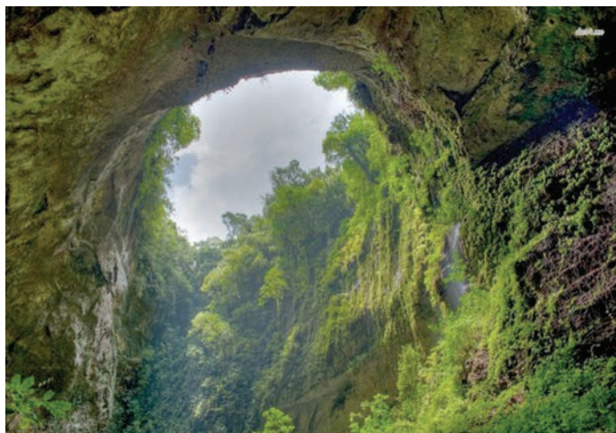
▲ Sơn Đoòng Cave in Phong Nha - Kẻ Bàng National Park, Quảng Bình province

"Sơn Đoòng Cave in Việt Nam's Phong Nha - Kẻ Bàng National Park has ceilings so high (180m) they could accommodate the Washington Monument," writes on the magazine, adding that a cave is so massive that a 747 could fly through its largest cavern.