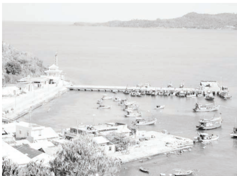
▲ The Law on Sea and Island natural resources and environment, an important legal tool to implement effectively the integrated and unified management of sea and island natural resources and environment

Environmental protection in general, sea and island environmental protection in particular have been paid special attention by the Party and the Government. The Politburo has promulgated Resolution No. 41/NQ-TW dated 15/11/2004 on environmental protection during the industrialization - modernization of the country with the objective of “prevention, restriction of pollution escalation, treatment of pollution, rehabilitation of ecosystems, gradual improvement of environment quality”. Later, the Secretariat of the Central Committee Communist Party also promulgated Indicative No. 29/CT-TW dated 21/1/2009 identifying and affirming the criteria “fast, effective and sustainable development, economic development together with assurance of advance, social equality and environmental protection”. Particularly, on 3/6/2013, at the 7 th meeting of the Central Committee of the Party Tenure XI, Resolution No. 24/NQ-TW on active responding to climate change, enhancing natural resources management and environmental protection was promulgated, of which identifying the objective of “To 2020, basically, active response to climate