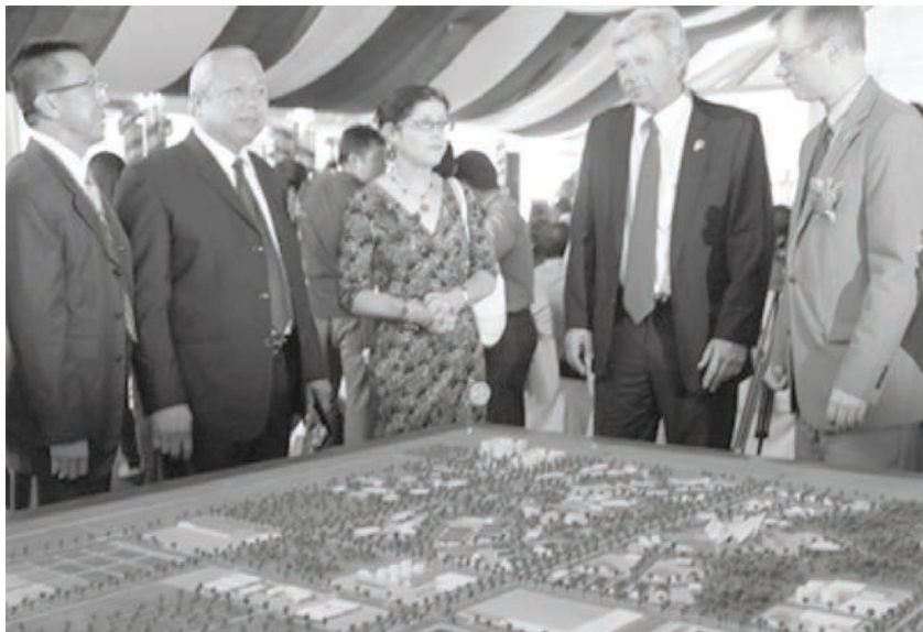
▲ CWS/VWS leaders introduce the project.

The huge environmental project is located on an area of lowland most-