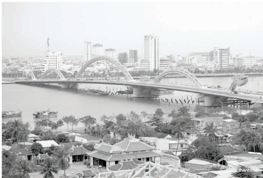
▲ Đà Nẵng is building Environmental City toward 2020

The goal aims to develop Huế city into an eco-urban with economic development towards a green