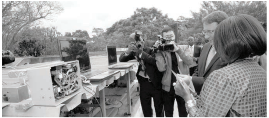
▲ UNEP Executive Director, Achim Steiner and Kenya's Cabinet Secretary for Environment, Prof. Judi Wakhungu launch the pilot air quality monitoring system

UNEP Executive Director, Achim Steiner said, "Each year, air pollution causes 7 million wholly preventable premature deaths around the world, with outdoor pollution responsible for more than half of that total. Among of those, 88% of deaths related to outdoor pollution occur in low- and middle-income countries. However, it is these same developing countries that typically lack access to data on their air quality. UNEP's device can build a bid data to help