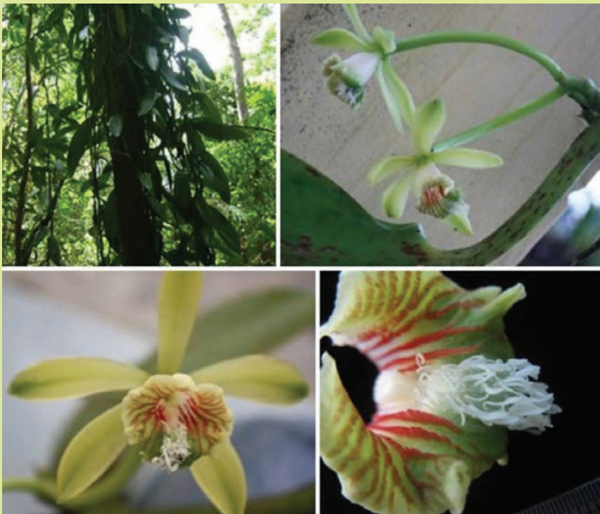
▲ Miguelia Cruenta Aver & Vuong

Before, the Vietnamese institute and the Czech Republic’s Prague garden have also jointly uncovered 2 new members of the ginger family named Zingiber discolor and Zingiber yersinii. Meanwhile, Miguelia Cruenta Aver & Vuong - a wild