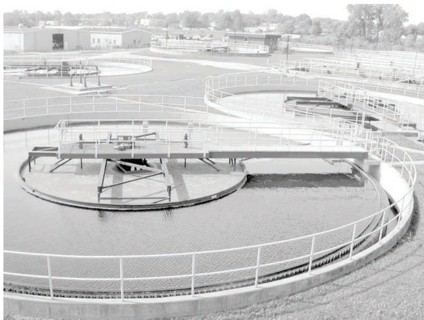
▲ Many environmentally friendly and advanced technologies have been applied to treat pollution

Environmental technology sector in Việt Nam has been established and developed through domestic production and import to meet sustainable socioeconomic development demands, in particular after the Law on Environmental Protection was enacted. Domestic science and technology organizations have played an important role and made positive contribution to developing environmental technology in Việt Nam. Among the studied technologies, many have been applied effectively such as wastewater treatment (mechanical, chemical, chemical/physical, biochemical, and biological methods), emission treatment using dry methods (depositing com-