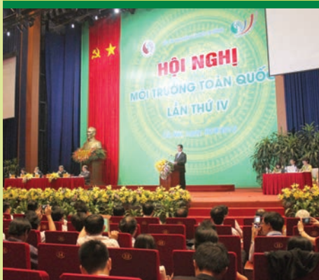
Prime Minister Nguyễn Tấn Dũng's speech at the fourth National Conference Environment