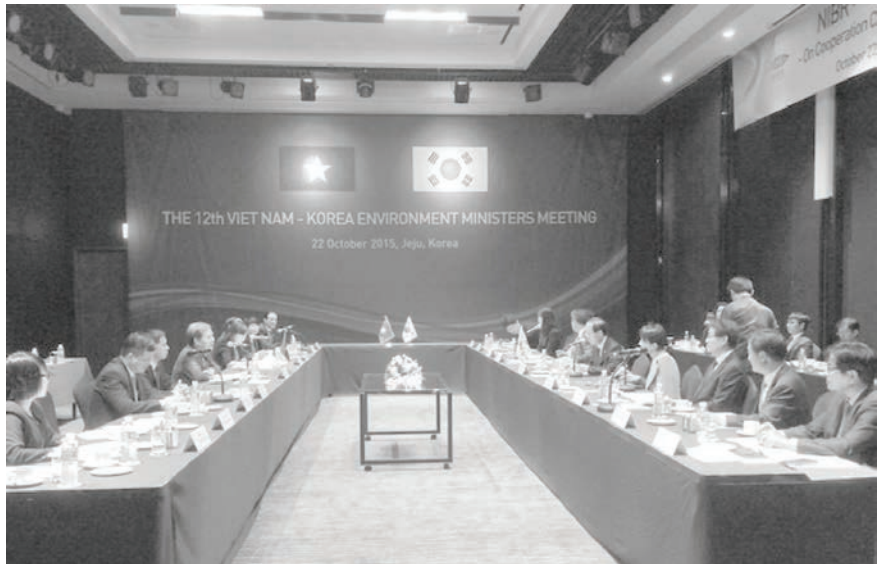
▲ Overview of the 12 th Việt Nam - Korea Environment Ministers Meeting in Jeju, Korea

Korean Minister of Environment, Yoon Seong Kyu proposes to strengthen inter-governmental cooperation on sustainable use of biological resources; conservation, management of national parks, and protected areas; cooperation on environmental infrastructure and environmental industry and technology; concentration on joint international cooperation projects on supporting localities that are being implemented in Việt Nam (including: “Development of the water quality monitoring system in Việt Nam through TOC, TN/TP indicators”; “Development of technologies to manufacture biodegradable plastics and environmental friendly plastics”; “Development of wastewater treatment system using ozone in water