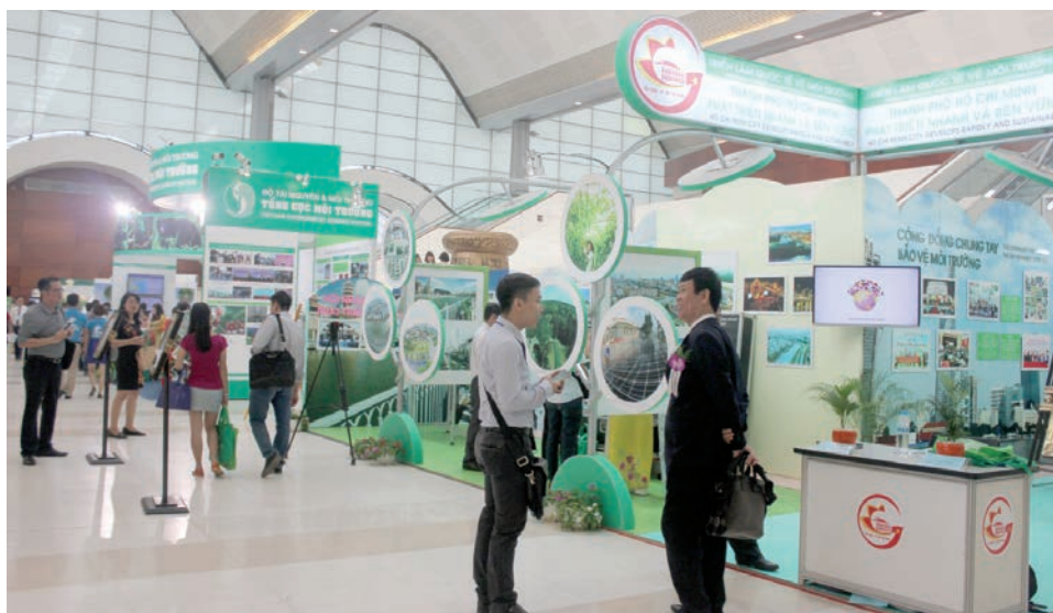
▲ International exhibition on environmental protection