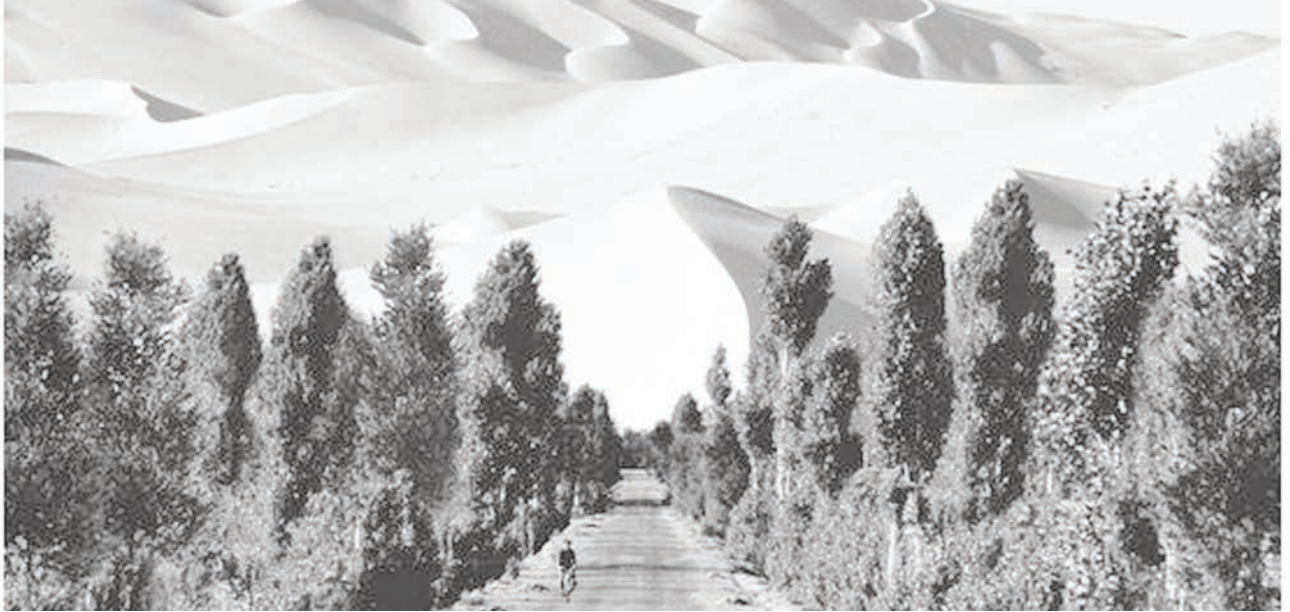
▲ China is building a Great Green Wall of trees to stop desertification

The Great Green Wall of China known as the Three-North Shelter Forest Program is the biggest tree planting project on the planet with the purpose to create a 2,800-mile long green belt to hold back the quickly expanding Gobi Desert and sequester millions tons of CO 2 in the process. It is expected to complete by 2050, thence increase forest cover from 5 - 15% overall of China's.