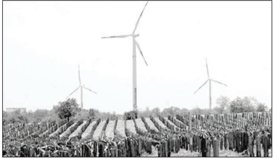
▲ A wind- power system in Binh Thuận Province. Việt Nam leads among ASEAN countries in using green energy.

Over the last decade, environmental policy across ASEAN had been higher on the agenda, but