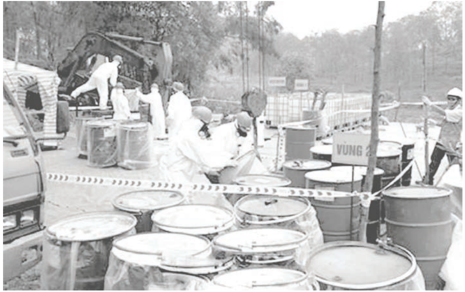
▲ UNDP supports Việt Nam on plant protection products contamination treatment

Second , indicators on resilience, response to climate and disaster risks: extreme climatic phenomena have caused impacts on human and properties for Việt Nam, particularly poor residential communities and ethnic minorities in coastal and mountainous areas. On the other hand, it is necessary to enhance climate change resilience for infrastructure, transportation vehicles and indus-